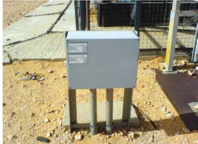
CJB with hot-dipped galvanised steel supports

Hot-dipped galvanised steel supports for installation on concrete foundations or supports for wall mounting with conduits, etc. available on request.