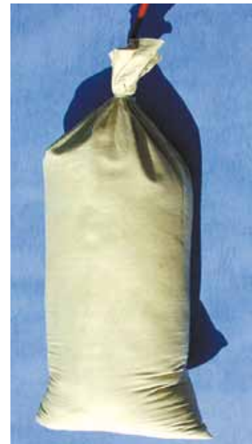
Reference electrode available with 5 m HEPR/PVC or (XLPE/PVC) 1 x 10 mm 2 cable