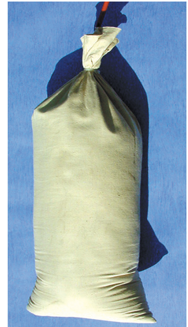
Reference electrode available with 5 m HEPR/PVC or (XLPE/PVC) 1 x 10 mm 2 cable